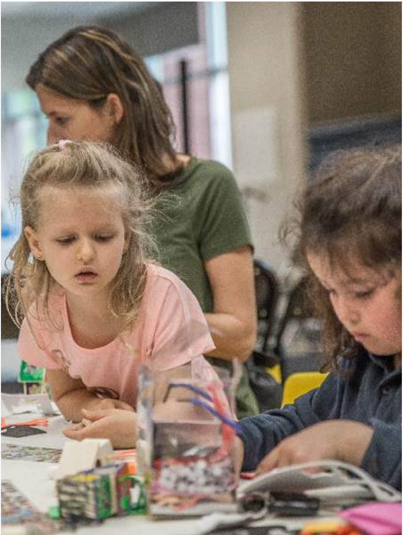
Children crafting at the HIPPY Oakville site