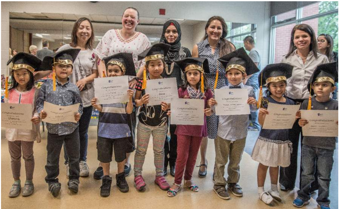
2017 Graduation day at HIPPY Oakville site