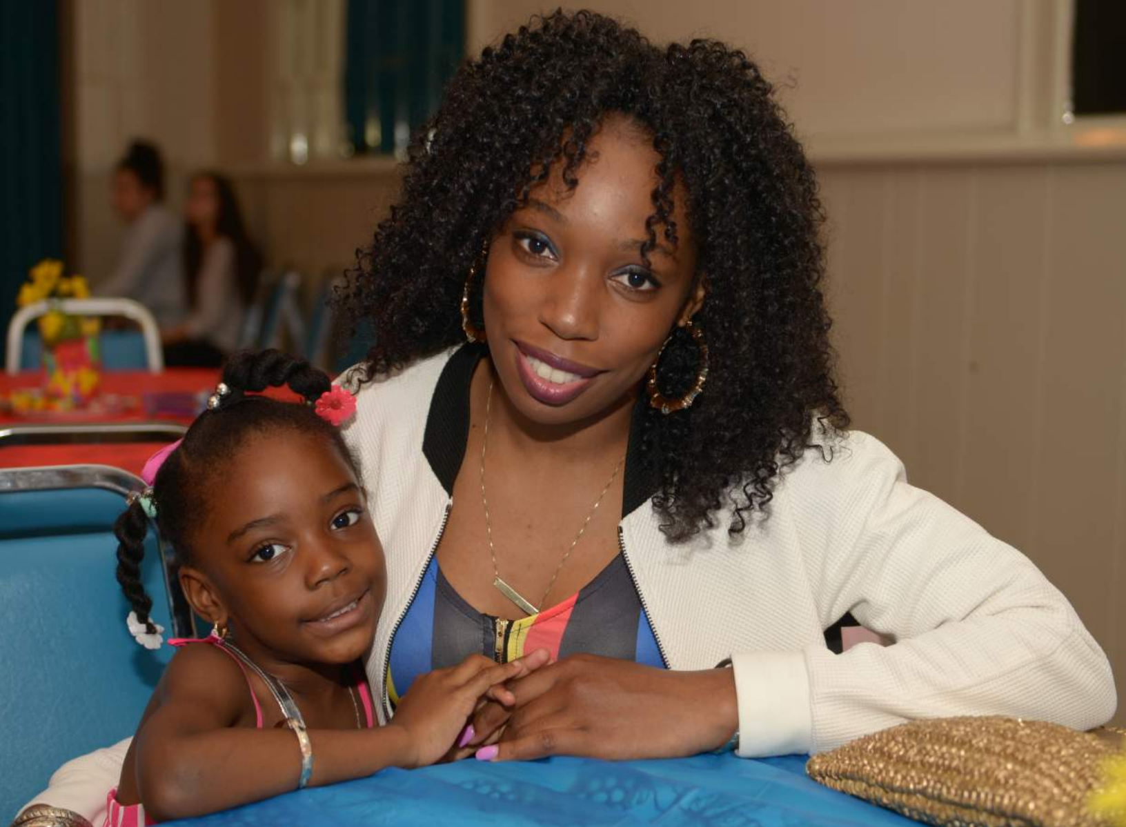
HIPPY mother with her daughter at HIPPY for Young mothers site graduation day in Toronto

Mothers Matter Centre gratefully acknowledges our funders and donors for their generous support.