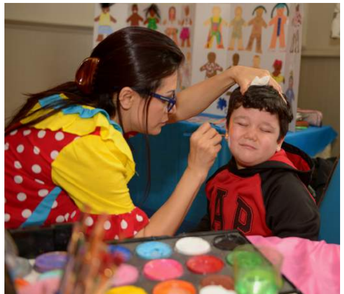
HIPPY for Young mothers site 2017 graduation day in Toronto

The HIPPY mothers involved in our 2017 Annual Adopt-a-Reader program – offered by First Book Canada and TD Bank – adopted a record number of non-HIPPY mothers and supported them to read to their children. Together they spent 300,000 minutes of reading aloud to their children over a period of three weeks.