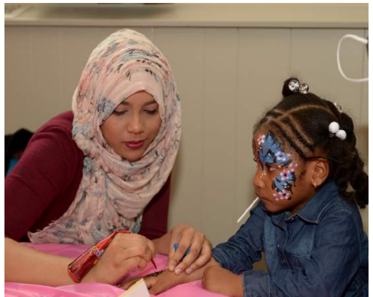
HIPPY for Young mothers site 2017 graduation day in Toronto

The HIPPY Summer Program was designed and delivered in two locations to engage isolated, newcomer families in fun and creative summer group learning activities to help parents prepare their children to enter the Canadian school system.