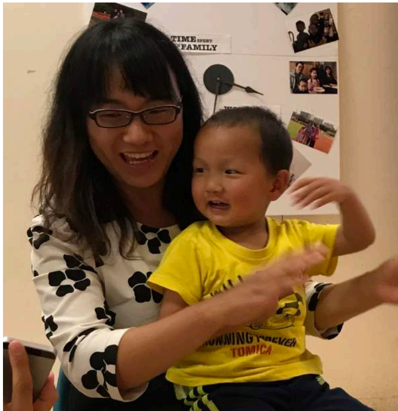
A mother and her child enjoying circle time, Bond to Literacy Program, May 2017