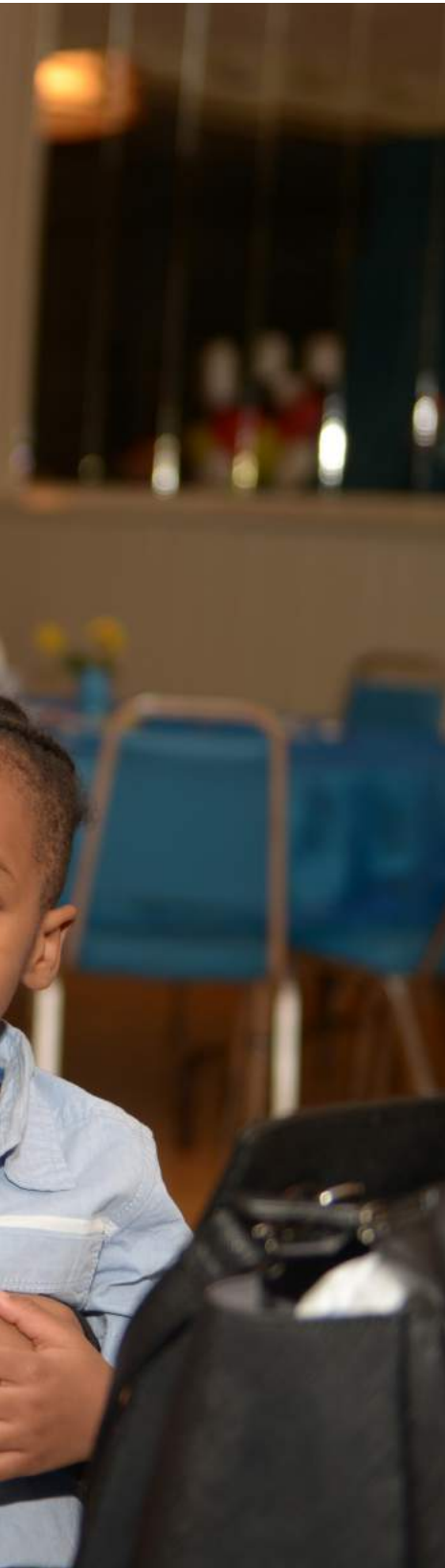
HIPPY mother with her children at HIPPY for Young mothers site 2017 graduation day in Toronto