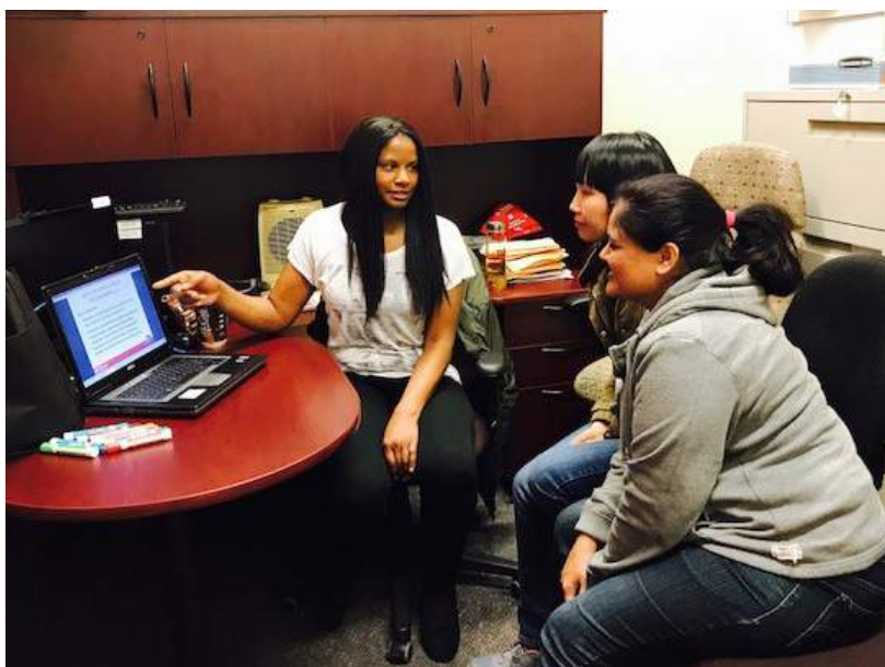
HIPPY Home Visitors