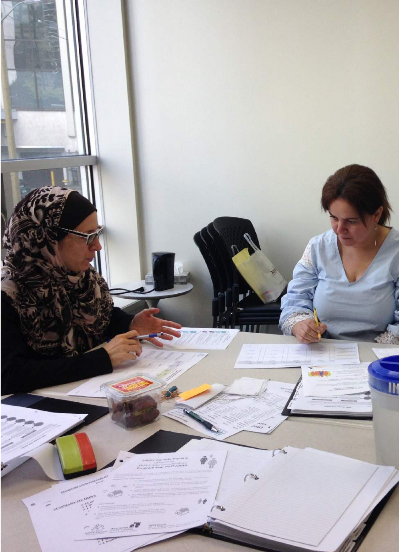
Pre-service training for new Coordinators in Vancouver - September 2017