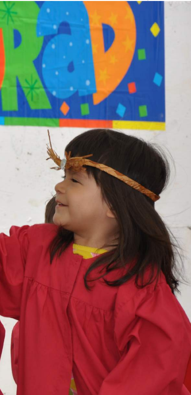
Graduations 2015 - Vancouver Urban Aboriginal HIPPY site