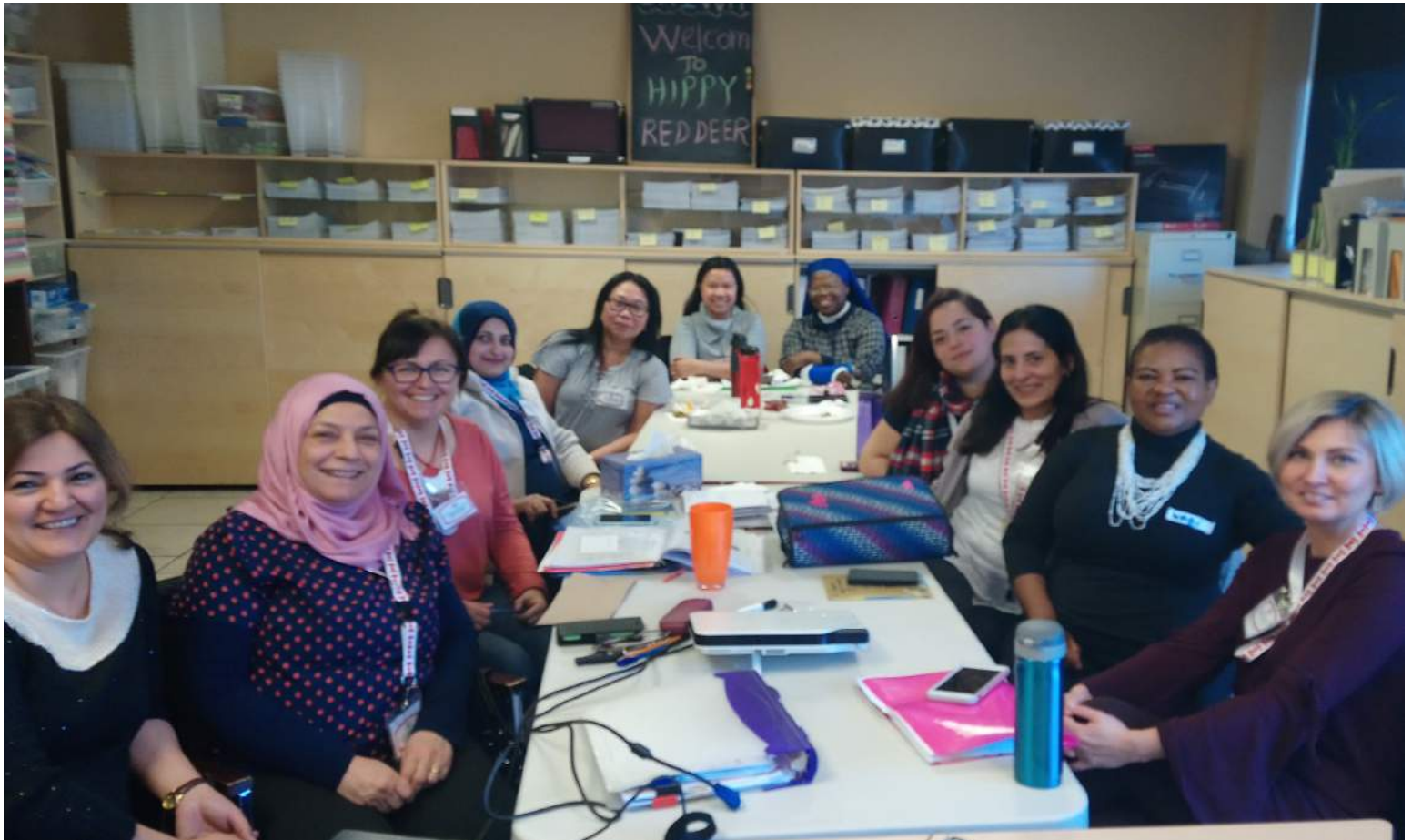
Training at HIPPY Red Deer site